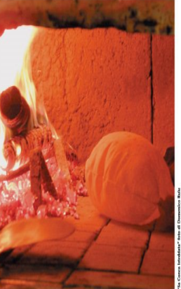
PRODUZIONE: ARTIGIANATO - ENOGASTRONOMIA