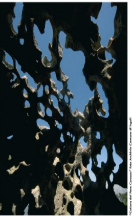
AMBIENTE: MARE E MONTAGNA - SPORT - ESCURSIONI