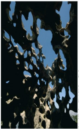
AMBIENTE: MARE E MONTAGNA - SPORT - ESCURSIONI