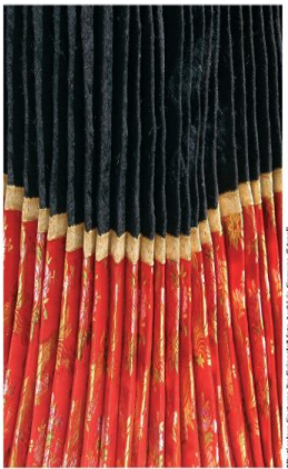
CULTURA: MUSEI - ITINERARI ARCHEOLOGICI E SACRI ARTE E TRADIZIONI - PERCORSI NEL CENTRO ABITATO FESTE, SAGRE ED EVENTI