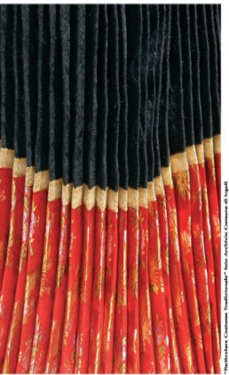
CULTURA: MUSEI - ITINERARI ARCHEOLOGICI E SACRI ARTE E TRADIZIONI - PERCORSI NEL CENTRO ABITATO FESTE, SAGRE ED EVENTI